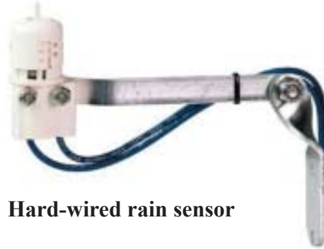
Hard-wired rain sensor

There are two kinds of rain sensors available - wireless and hard-wired. Here are two examples: