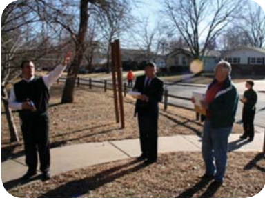
Members of the Steering Committee discuss options at Crane Park.

The plan is expected to be completed by April 2008 and will be available to the public. Visit www.derbyweb.com/parks-recreation-master-plan/home.cfm to learn more.