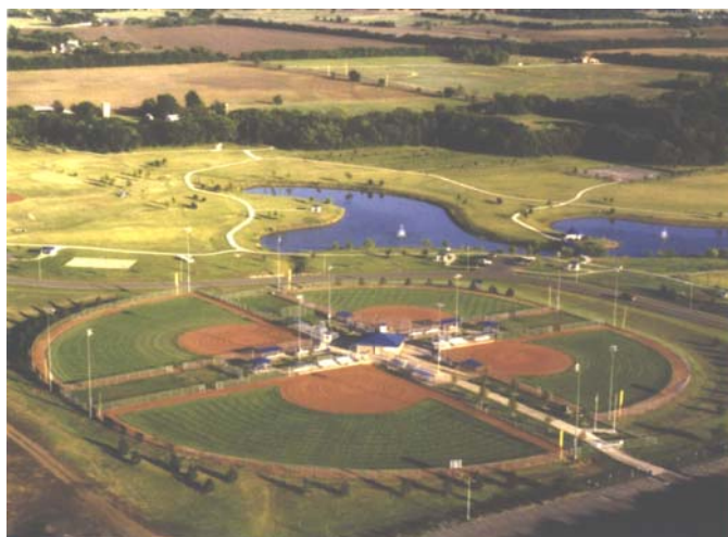
High Park Softball Complex, which is located approximately a 1/2 mile east of Rock Rd. at 2801 E. James in Derby. Games are played at High Park, Garrett Park, Tanglewood and Riley Park ball fields.