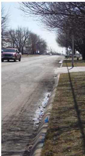
Buckner Street looking south towards K-15.

near the back of the curb at driveways to maximize space for driveway parking.