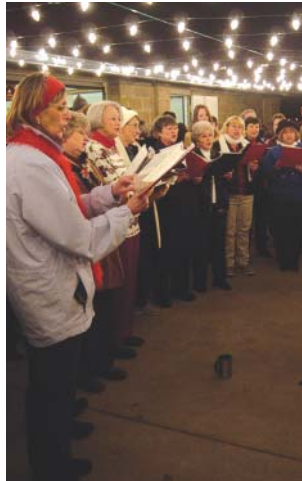
The Derby Community Choir performs at the 2007 Tree Lighting at High Park.

The Chamber of Commerce will hand out shopping bags to the first 300 attendees. Following the event, residents are encouraged to “shop Derby” as local retailers will be open late to accommodate shopping needs just 21 days before Christmas. The shopping event lasts through December 13. You can also sign up for a chance to win a door prize at the participating merchants.